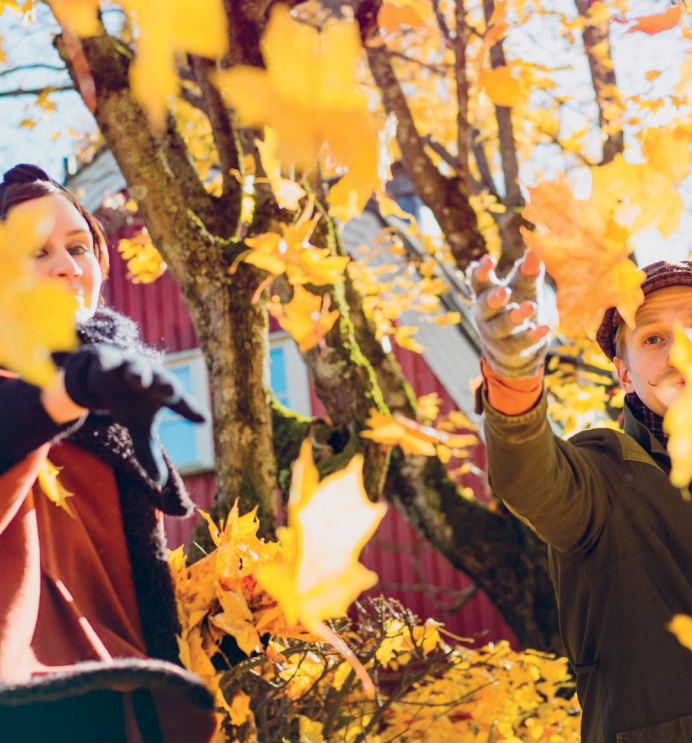
JUSSI HELLSTEN / VISIT HELSINKI